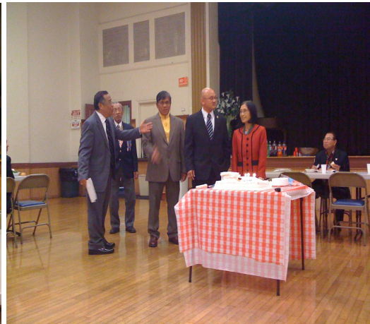
March Birthday celebrants